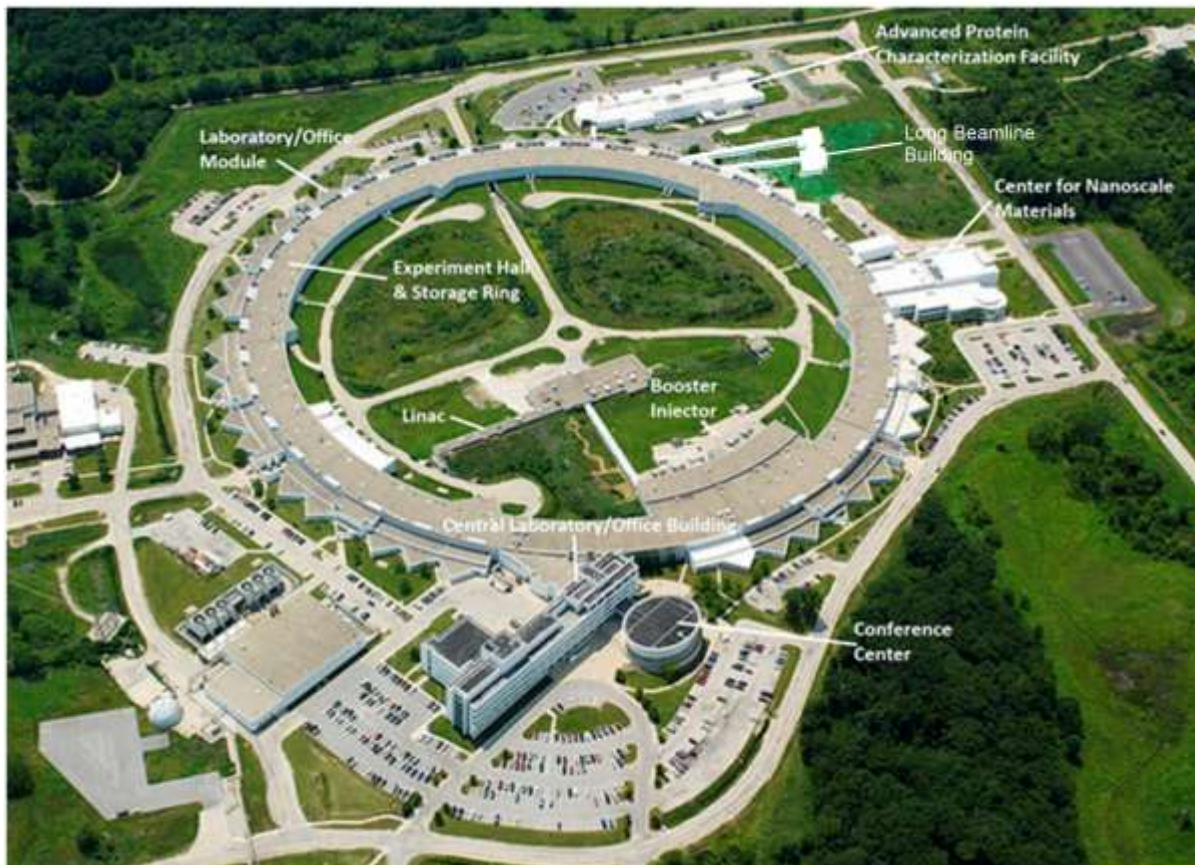
Figure 2-1. Aerial View of APS Complex

An aerial view of the APS complex is shown below in Figure 1-1. The APS consists of a number of buildings that contain electron injection systems, electron storage ring systems, x-ray beamline systems, and support systems. At a high level, the APS can be thought of as three parts: accelerating electrons, producing photons, and using photons, as discussed below.