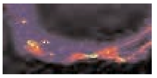
FIG 3. Cu Ka fluorescence intensity map.