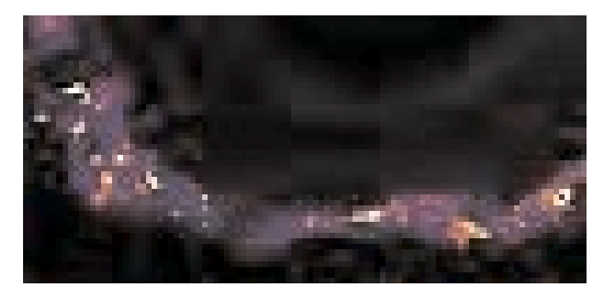
FIG 1. Ca K\beta fluorescence intensity map.