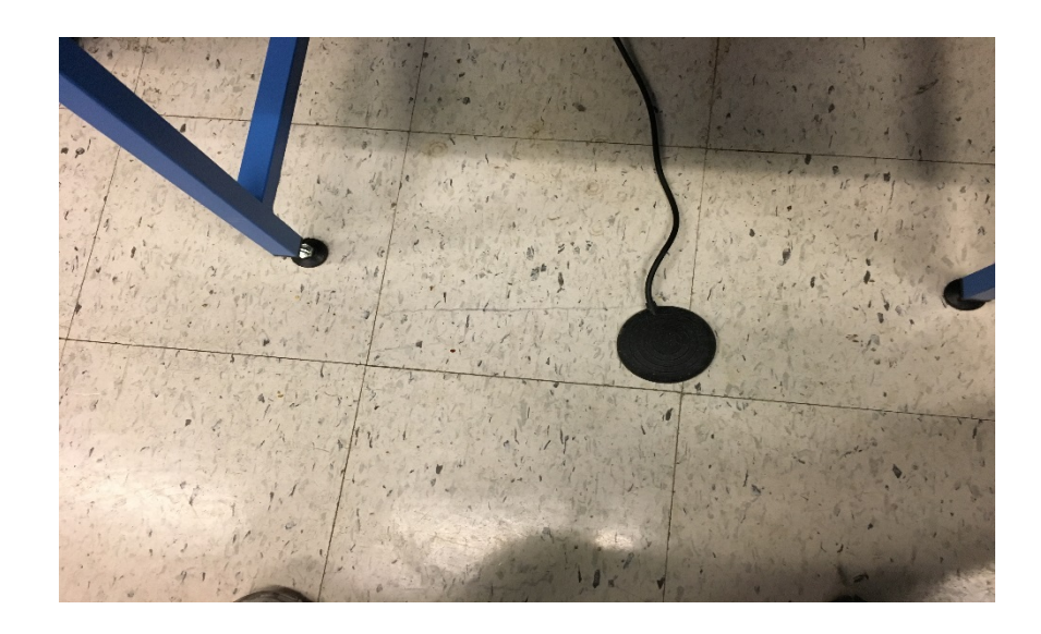
Step 9: When you have finished cleaning the part(s), put the spray switch back to the center setting and use the compressed air hose next to the cleaner to dry the parts. The compressor hose is long enough to allow drying the parts inside the cleaner. Push down the black handle to operate.