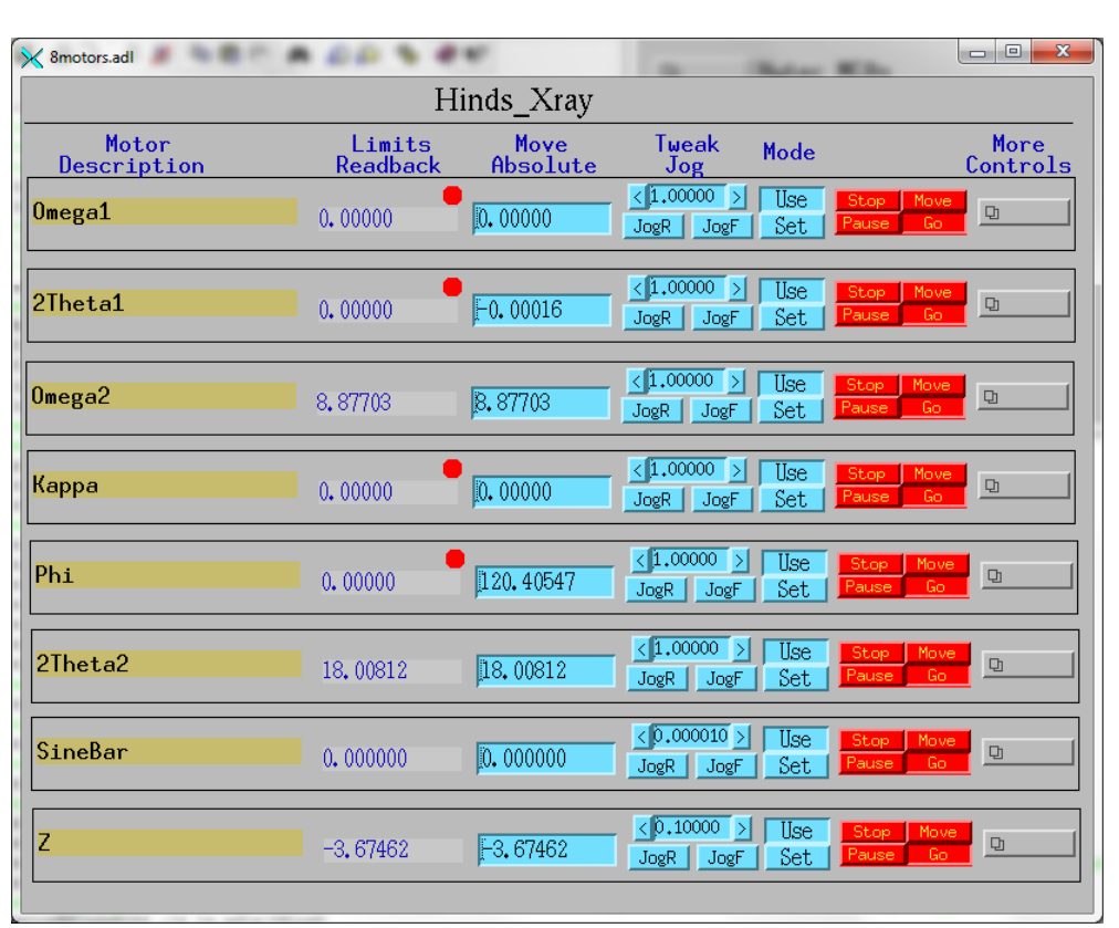
8 motors, GeoBrick-LV