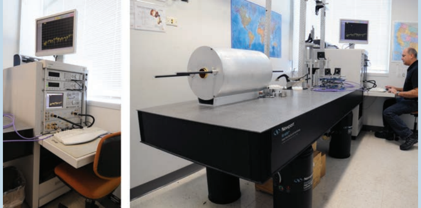
Building 401, Lab 3129 RNA test stand

The Lab 3129 test area uses a precision network analyzer (10 MHz to 20 GHz) with precision translation stages to allow bead-pull measurements to be made repeatable on or off axis, and uses a stepper motor controlled by a separate computer with LabView. The LabView program is modified for each individual rf experiment as required. This system also provides a unique capability that uses two 81110A pulse/pattern generators and a 25623A H81 pulse test set, which allows for S-parameter measurements to be made inside the pulse.