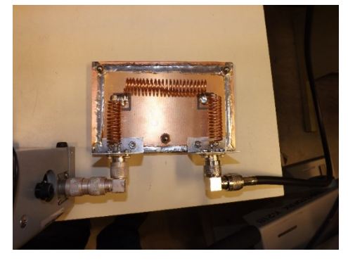
9.77MHz output Harmonic Filter

Bunch-Lengthening Harmonic Cavity coupler. The input cavity/cover assembly for the CPI L-band IOT has been sent to CPI for replacement of a damaged high-voltage blocking capacitor. Modification of the MPA itself to accept the L-band IOT has been started.