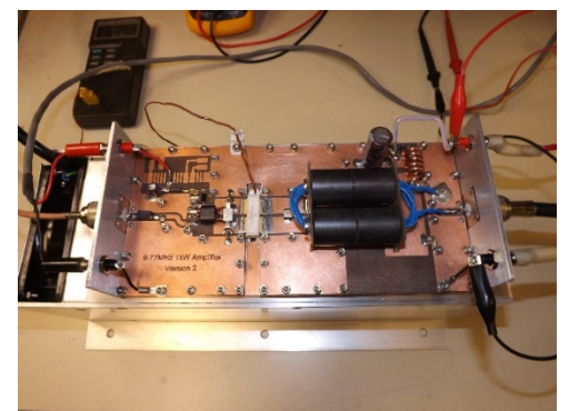
9.77MHz/1kW prototype amplifier #2

APS-U work has been started to convert the Multi-Purpose Amplifier (MPA) to L-band operation by fitting it with a CPI L-band IOT. The MPA will utilized be to provide а nominal 20 kW cw of rf power for testing the