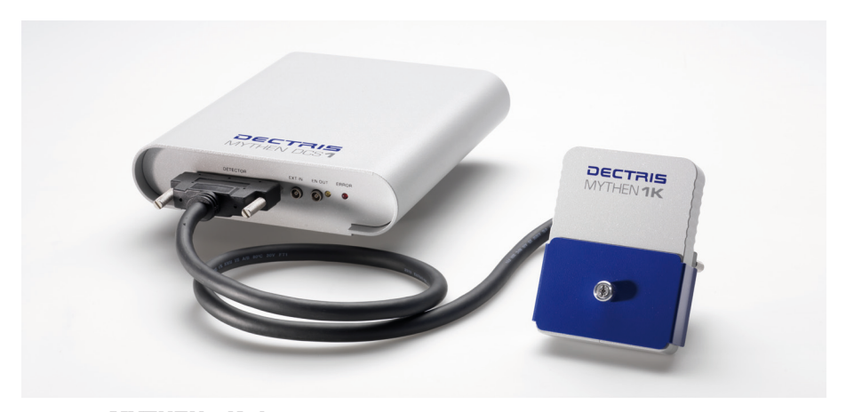
MYTHEN 1K detector system

Three different detector control systems are available in which up to 24 MYTHEN 1K detectors can be combined to form a large multi-detector system to cover large angles.