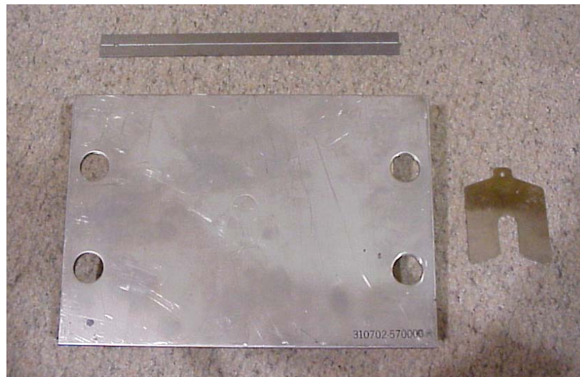
Fig. 3: A SR standard damping pad and the smaller quadrupole damping pad used for this study. One-foot rule shows scale.

Three damping configurations were used for each of the three girder support cases. The damping configurations were; undamped, girder-damped, and girder/quadrupole-damped. The girder-damped configuration used the standard SR damping pads (Fig. 3). The girder/quadrupole configuration used both the SR damping pads and quadrupole damping pads made with 3M-468 viscoelastic material between two 3-mil stainless-steel shims.